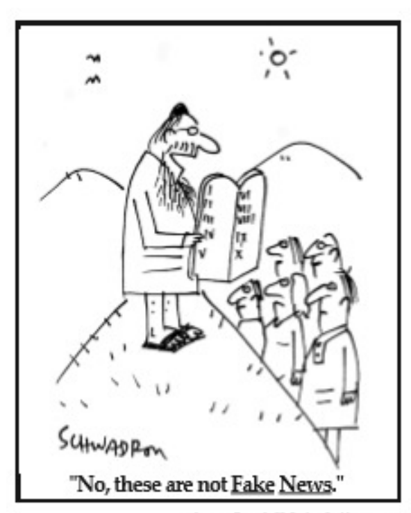
from JoyfulNoiseletter.com Reprinted with permission