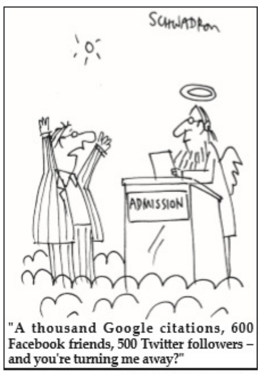
from JoyfulNoiseletter.com Reprinted with permission