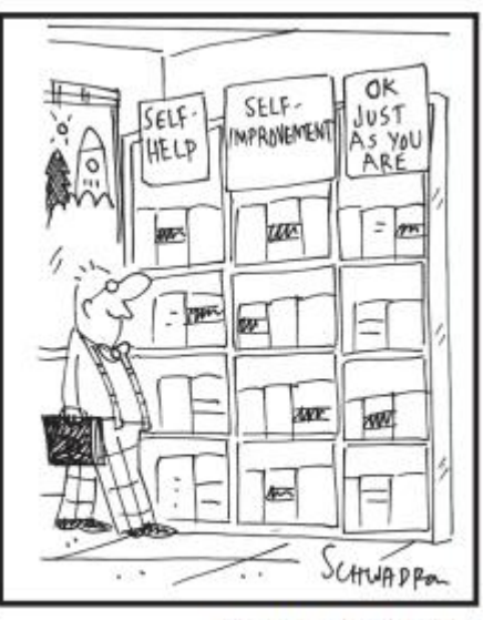
from JoyfulNoiseletter.com